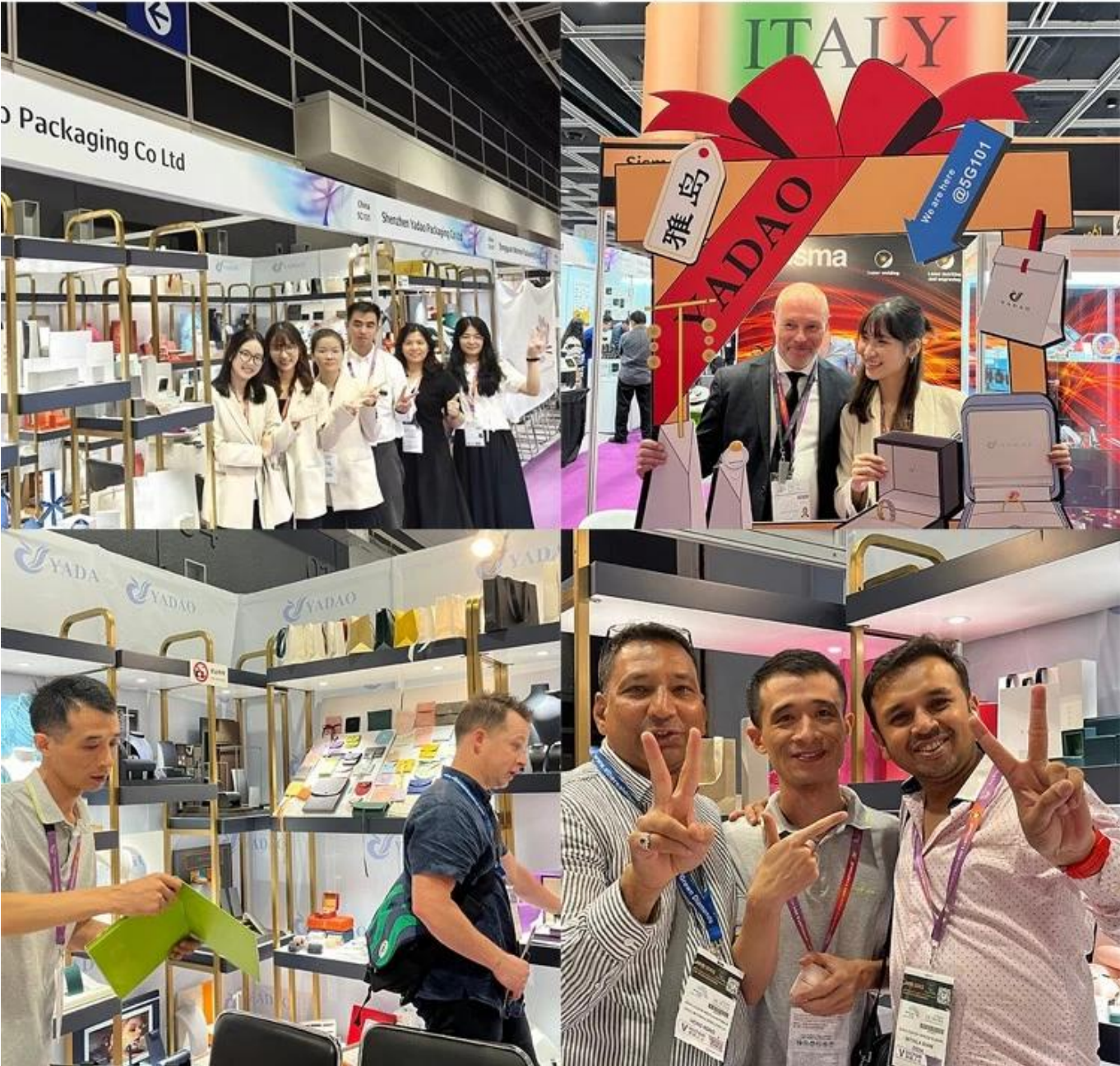
□Packaging and delivery□